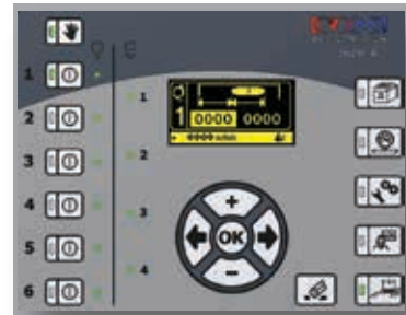
Pattern | Display