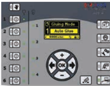
Auto Glue Mode