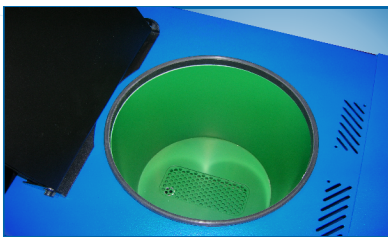
Teflon® coated tank for a faster and easier maintenance.