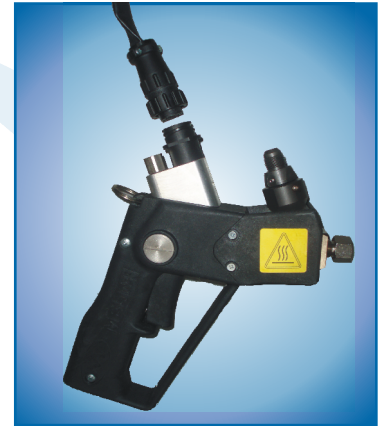
New connector allows for easier manual applications.