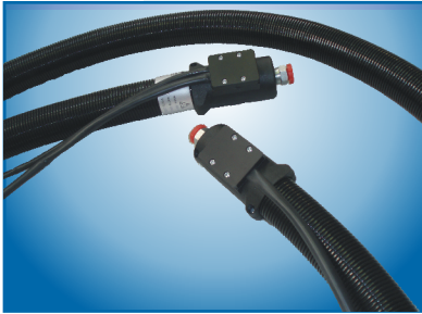
Corrugated hose for increased resistance and safer operation.